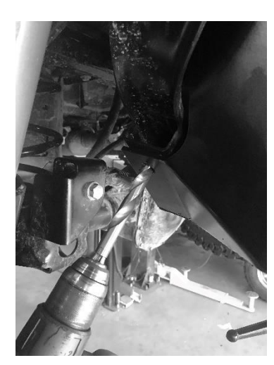
Fig.4 Fig.5 Fig.6

With the skid fully pushed up against the stock skid the front feet should be resting on the stock skid drop leg. Through the hole in the new skid, drill a pilot hole then a \frac{1}{2} " hole through the bottom part of the stock skid leg on both sides. (Fig.6&7) Through that hole, pass the \frac{1}{2} " lock nut and secure it with the