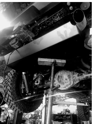
Fig.1 Fig.2 Fig.3

Slide the skid up onto your floor jack and position it under the jeep. You will have to start on the passenger side to get the skid over the exhaust pipe but once you have cleared that the skid should be