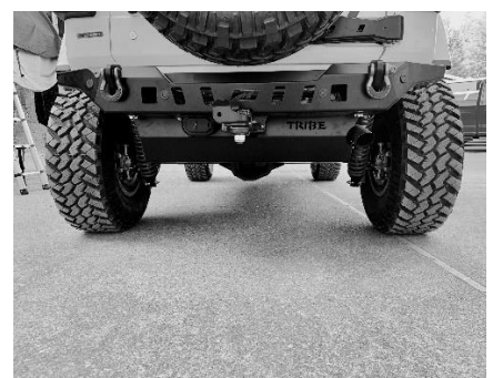
Fig. 7 Fig. 8 Fig. 9

½" bolt and washers provided, with your ¾" wrench and Socket. (Fig.8) Now with your 16mm tighten up all the bumper bolts, and with your 21 and 22 mm sockets, tighten up the rear feet and tow hook, and with all of your bolts tightened up, you can wheel with out worrying about smashing your DEF tank or exhaust.