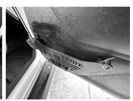
Fig.4 Fig.5 Fig.6