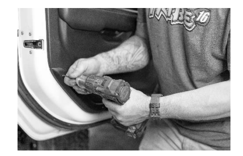
Fig.1 Fig.2 Fig.3