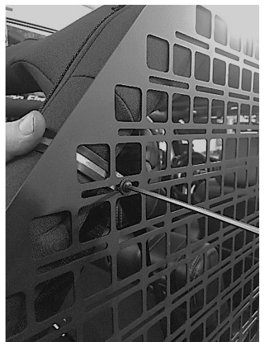
Fig.1 Fig.2 Fig.3